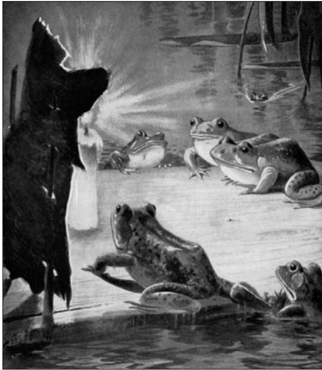
Figure 3. Attraction of frogs to a candle set out on a small raft. Illustration by Charles Copeland of an experiment in northern Maine or Canada described by William J Long (1901). Twelve or fifteen bullfrogs ( Rana catesbeiana ) climbed on to the small raft before it flipped over.

Within the sphere of lights, birds may collide with each other or a structure, become exhausted, or be taken by predators. Birds that are waylaid by buildings in urban areas at night often die in collisions with windows as they try to escape during the day. Artificial lighting has attracted birds to smokestacks, lighthouses (Squires and Hanson 1918), broadcast towers (Ogden 1996), boats (Dick and Donaldson 1978), greenhouses, oil platforms (Wiese et al. 2001), and other structures at night, resulting in direct mortality, and thus interfering with migration routes.