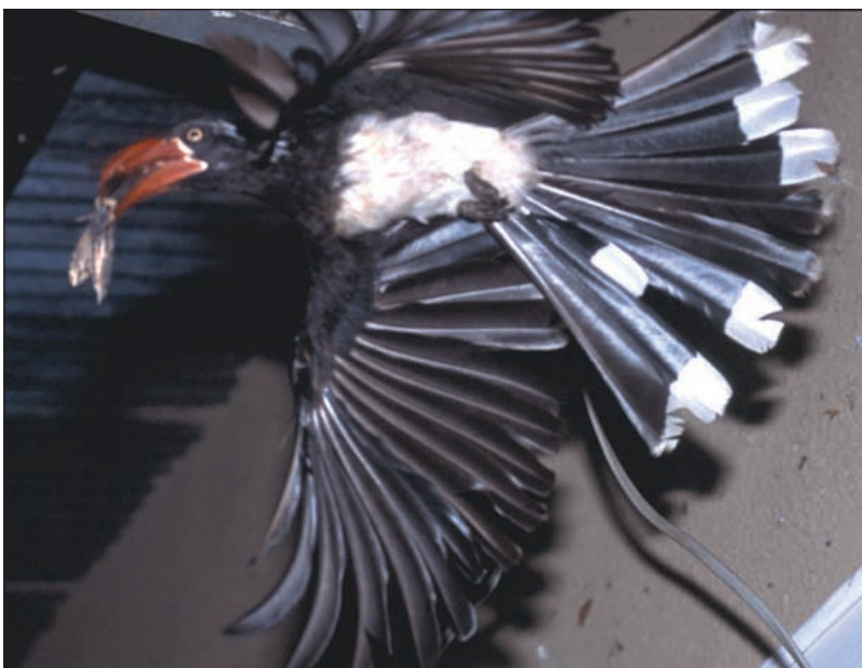
Figure 5. Crowned hornbill ( Tockus alboterminatus ) hawking insects at a light at the Kibale Forest National Park, Uganda.

Artificial night lighting could disrupt the interactions of groups of species that show resource partitioning across illumination gradients. For example, in natural commu-