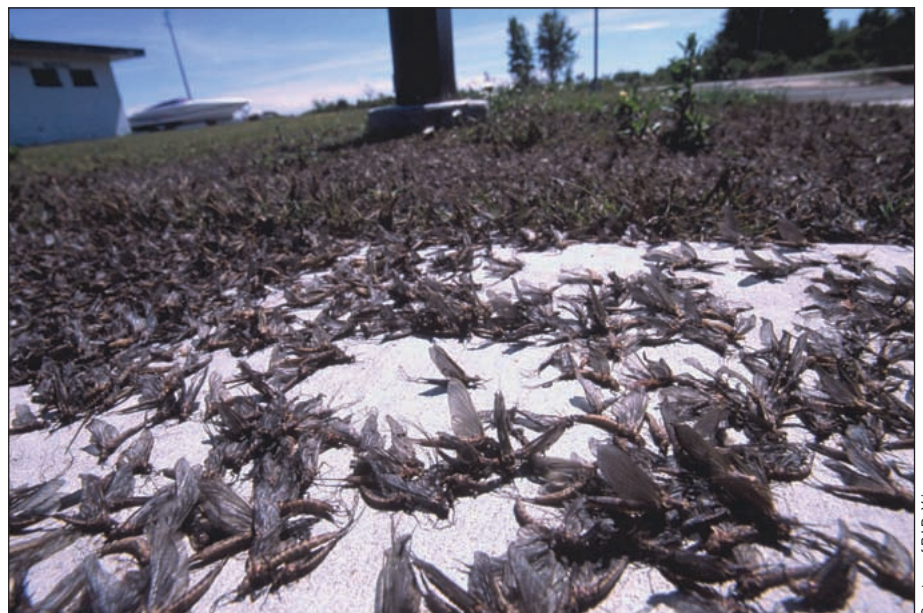
Figure 4. Thousands of mayflies carpet the ground around a security light at Milleccoquins Point in Naubinway on the Upper Peninsula of Michigan.

Many groups of insects, of which moths are one well-known example (Frank 1988), are attracted to lights. Other taxa showing the same attraction include lacewings, beetles, bugs, caddisflies, crane flies, midges, hoverflies, wasps, and bush crickets (Eisenbeis and Hassel 2000; Kolligs 2000; Figure 4). Attraction depends on the spectrum of light – insect collectors use ultraviolet light because of its attractive qualities – and the characteristics of other lights in the vicinity.